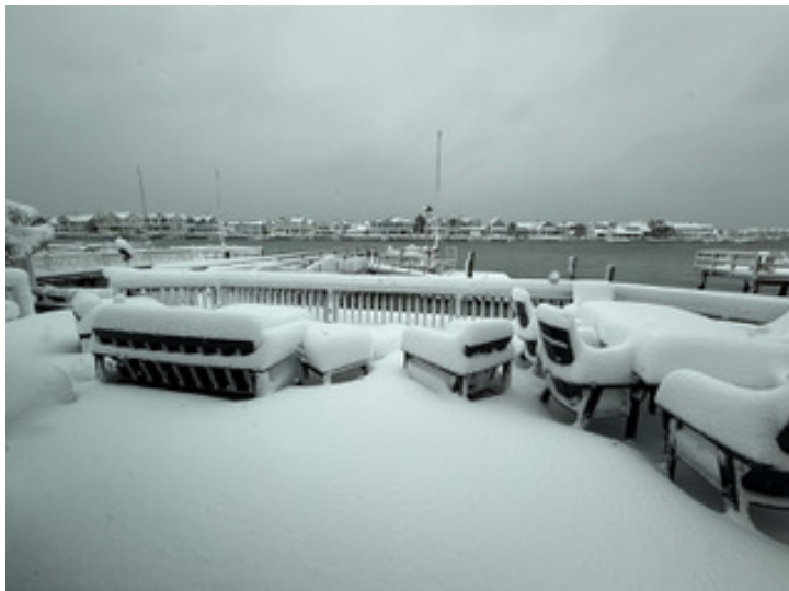
No cushions needed

Each month we bring you a recent photo of interest from around Stone Harbor.