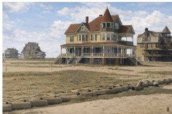
BACK IN TIME - "HYDRANGEA" 1908, Stone Harbor, N.J.

INTRODUCTION: Imagine a time machine that could transport us to an earlier time in Stone Harbor's 100+ year history. I don't know about you, but I am now about to set the destination and time selectors to "Stone Harbor, New Jersey" and the year "1908". That time period is where we will be devoting our attention for the next 6 months with upcoming SHPOA "Beach Buzz" editions. Our focus will be on the very early construction and development of Stone Harbor by featuring some of the first houses and other important projects shortly after the turn of the century. As property owners yourselves, it is my hope this next group of accounts with vintage archival photos about Stone Harbor will have added meaning to you. By the way, look for some interesting surprises along the way starting with this very account. So, let's go!