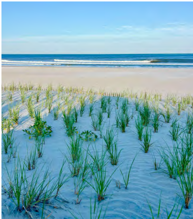
Welcome to the Fall beach scene

Each month we bring you a recent photo of interest from around Stone Harbor.