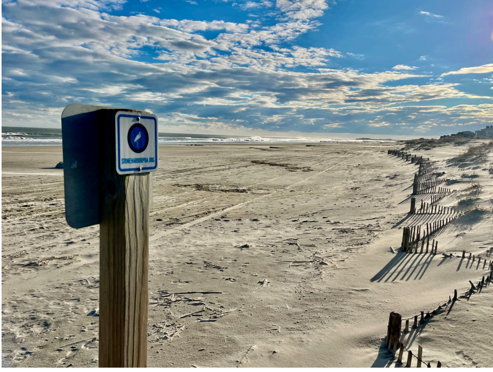
SHPOA at 104th Street; beach has been holding up well at this location

Each month we bring you a recent photo of interest from around Stone Harbor.