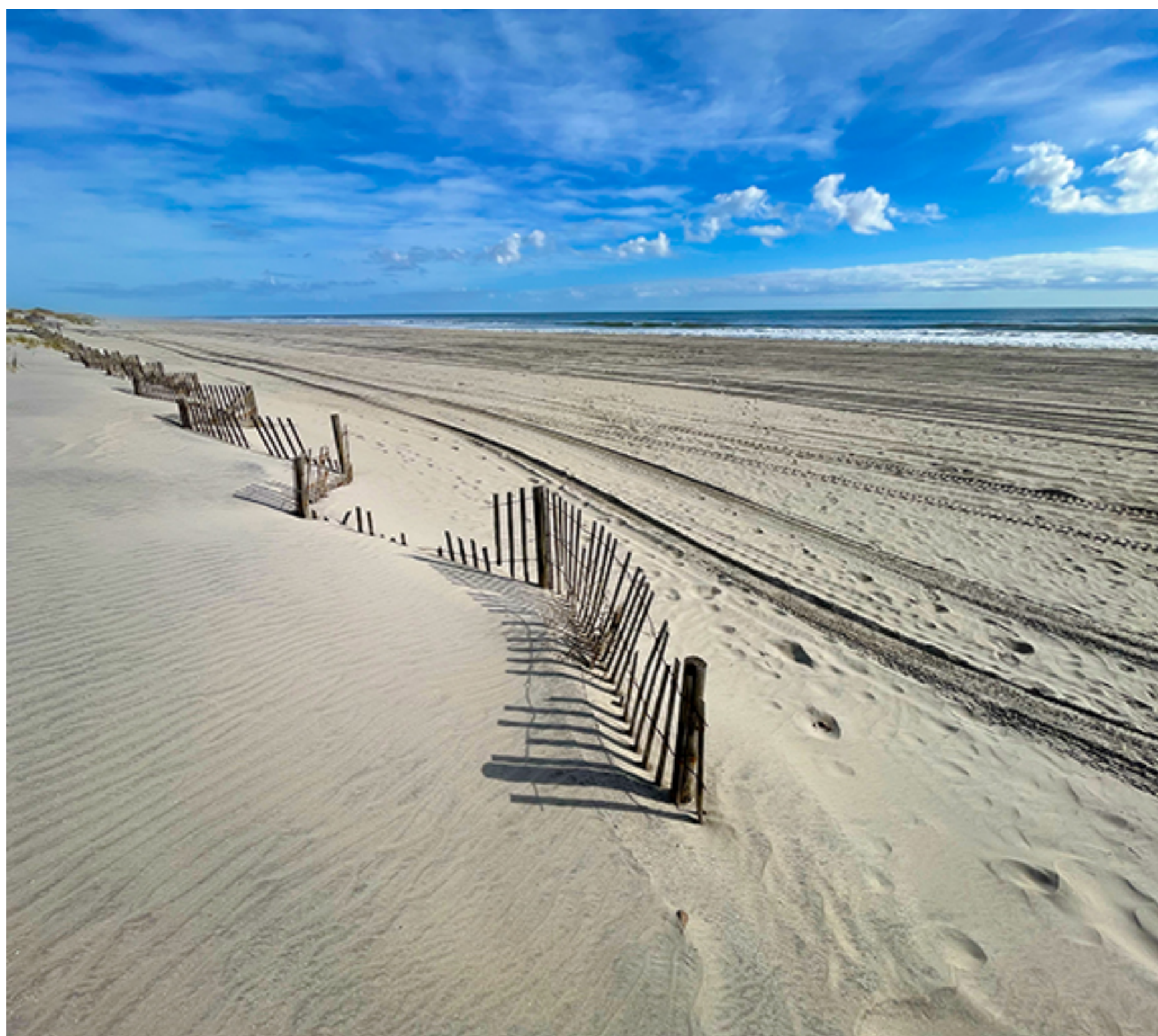
"Nice to have a big beach all to myself! (104th St.)"

Each month we bring you a recent photo of interest from around Stone Harbor.