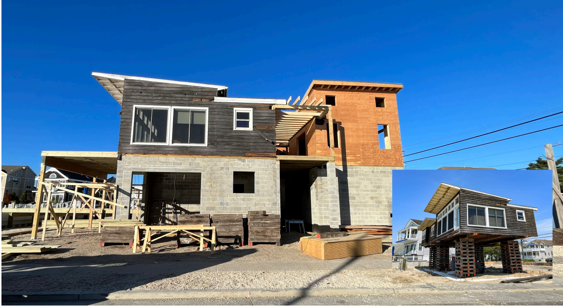
Progress on the house pictured in a previous Beach Buzz, creative mix of old and new (105th and 3rd)