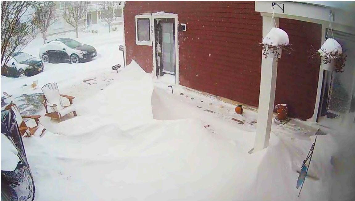
Golden Gate Drive, January 20, 2022, summer is almost here!