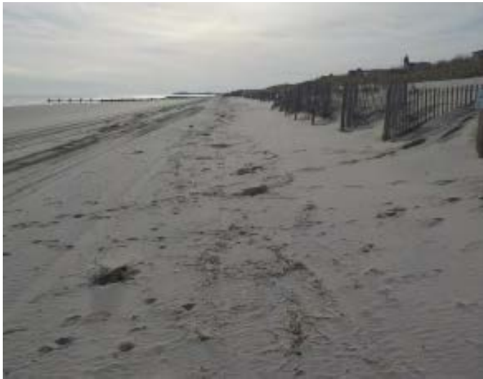
108 th Street Beach

108 th Street and 123 rd Street are two areas that continue to experience significant erosion and loss of beach.