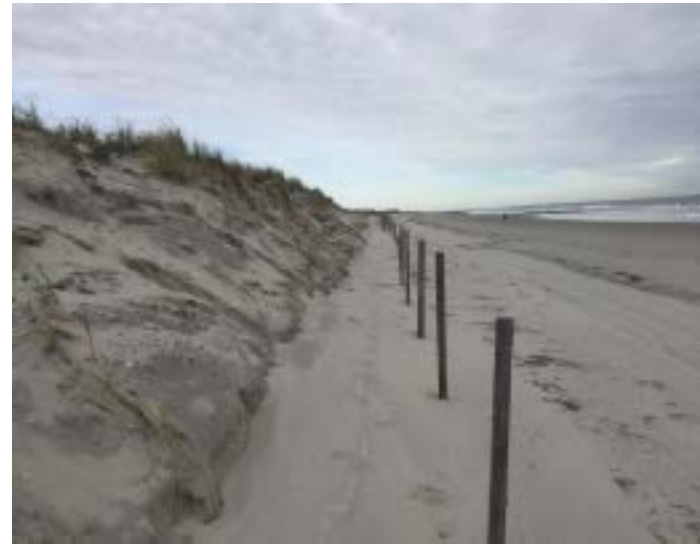
123 rd Street Hobie Cat Beach