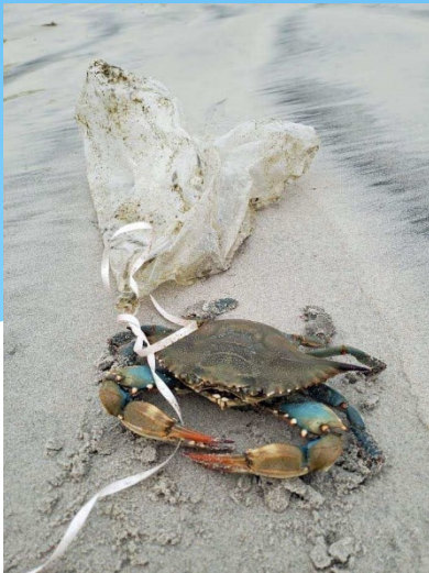
Photos taken on SH Beaches

The Borough Ordinance to address the effects of single use plastic bags and straws went into effect on June 1 st . The Borough continues to work with our local businesses to become in compliance. To date the Borough has approved 7 hardship requests which provides for additional time for businesses to comply. Council will continue to review any request on a case by case basis. We thank all our business owners for their cooperation and support.