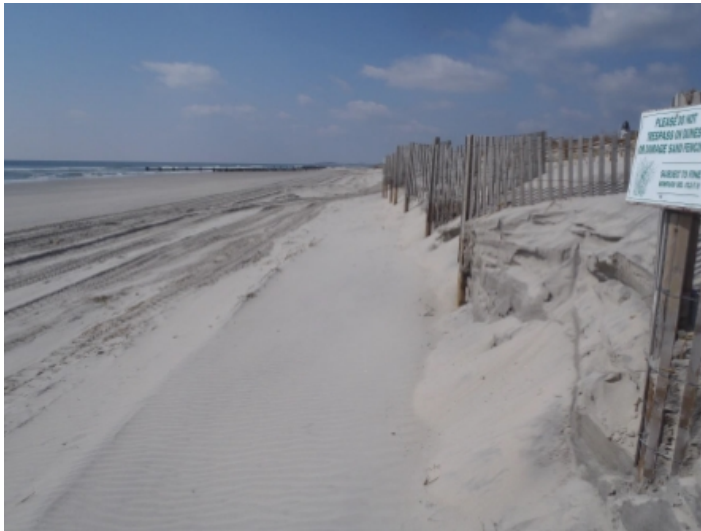
108 th Street Beach

108 th Street and 123 rd Street are two areas that experienced significant erosion and loss of beach.