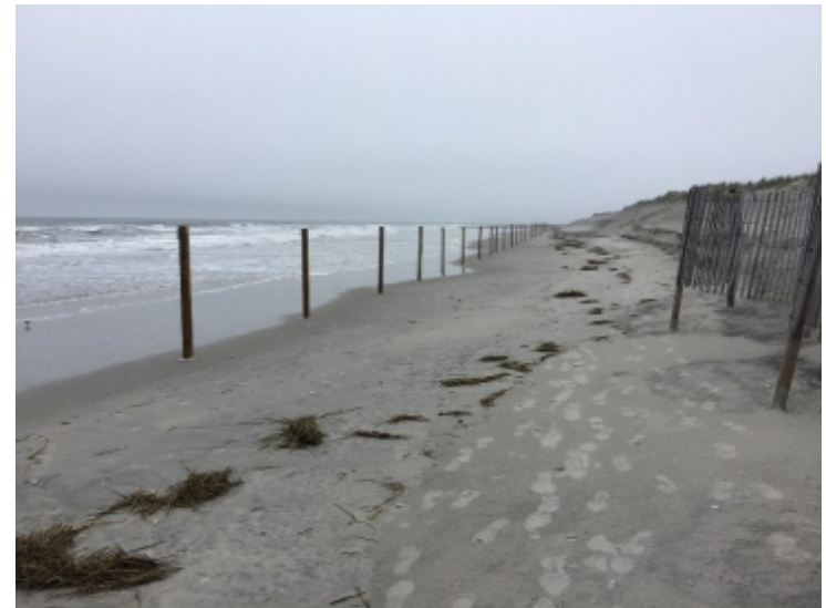
123 rd Street Hobie Cat Beach